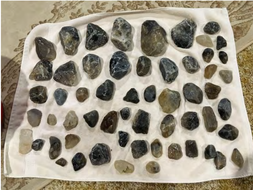
1 persons results with some hard work and a bit of luck

At last we could begin to fossick the in creek and its banks a number of members did very well indeed coming away with a bucket filled with Smokey and clear Quartz and 1 part Amethyst, others had to work a bit harder to make finds but the only grumbles came when we had to make our way back up the rope at the end of the day to the 4x4s carrying extra weight in the rocks we found.